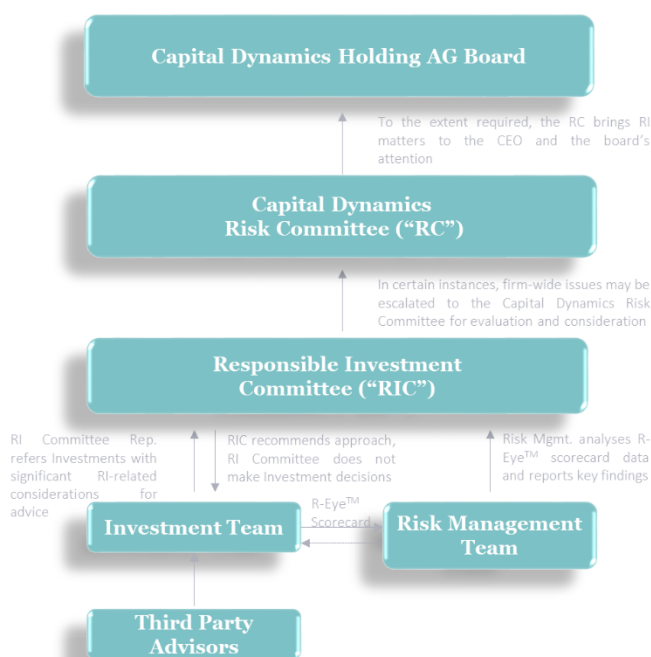
Figure 1: Capital Dynamics RI Alert process

The Chief Marketing Communications Officer, as the firm's ESG representative on the Executive Committee ("EC"), provides periodic updates on ESG matters to the EC. When significant ESG issues are identified, they are first brought to the Responsible Investment Committee for evaluation and to recommend next steps. In cases of firm-wide concern, the Chief Marketing Communications Officer escalates the issue to the Risk Committee for further review and action. If the situation necessitates, the Risk Committee will then inform the CEO and the Board for their consideration and decision-making.